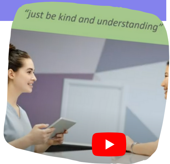
VIDEO: See some of the ideas our Autistic residents had on making it easier to visit the GP.

As shown in the current research , Autistic residents told us that they often find it difficult to manage the sensory environment of the GP practice. Many people said that they found not knowing what to expect (like knowing how long they might be waiting or who they would see) made visiting the GP anxiety provoking. Some people said using the phone to make an appointment was a big reason why they did not visit the GP. Many people also told us that interacting with staff who did not understand autism and how they could adapt their communication was a barrier.