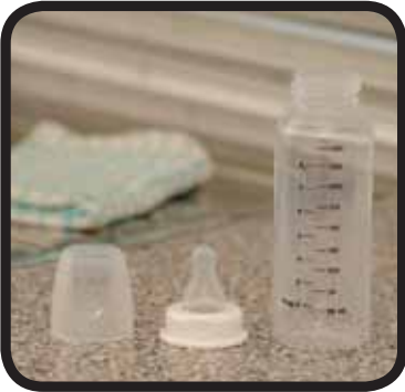
bottles with teats and bottle covers

You need to make sure you clean and sterilise the equipment to prevent your baby from getting infections and stomach upsets. You'll need: