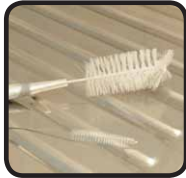
bottle brush, teat brush