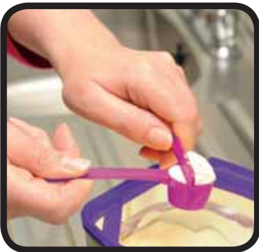
formula milk powder, or sterile ready-to-feed liquid formula