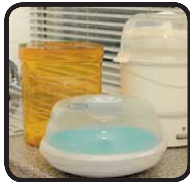
sterilising equipment (such as a cold-water steriliser, microwave or steam steriliser)