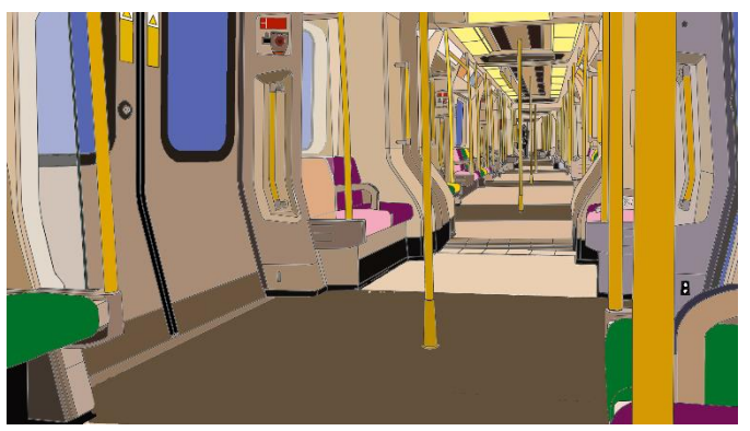
Interior of a tube train by Max Computer design