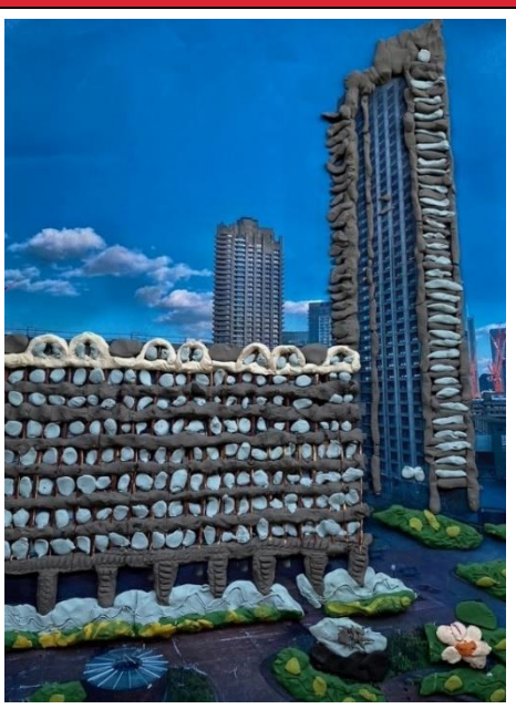
The View from my Window by Matteo mixed medium sculpture