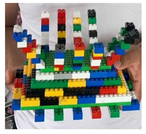
Brasilia Cathedral by Nihal Lego sculpture